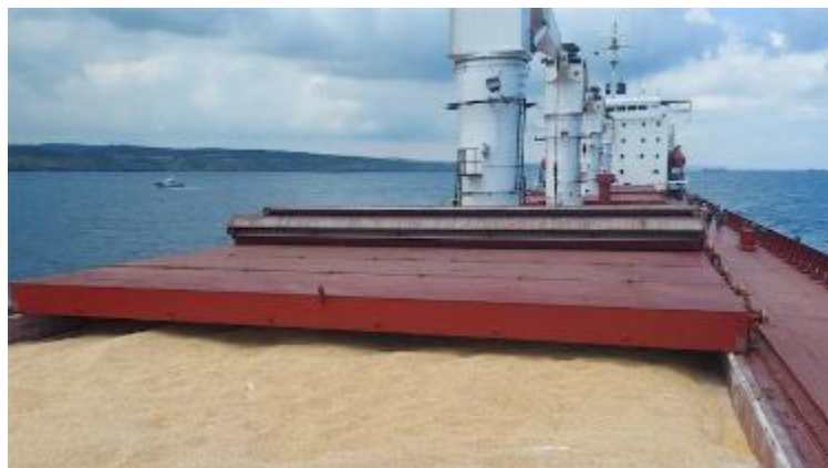
The first shipment of over 26,000 tons of Ukrainian food under the Black Sea Grain Initiative.

UN Secretary-General António Guterres announced the establishment on the same day of a Joint Coordination Centre to monitor implementation. It is hosted in Istanbul and includes representatives from Russia, Türkiye and Ukraine.