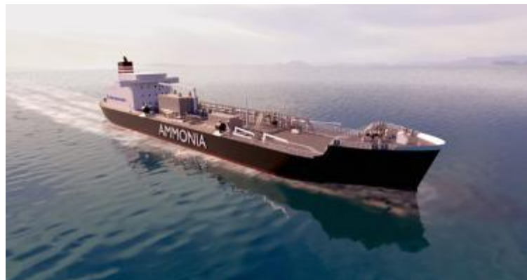
3D model of an ammonia bunkering vessel.

At the initial stage of designing or before the specific target ship to be implemented is decided, the design is examined based on the existing regulations such as international conventions and ship classification rules, and an Approval in Principle (AiP) is issued as proof of conformity with requirements.