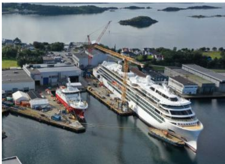
Viking Polaris at VARD Søviknes.

Viking Polaris is an ice-strengthened Polar Class 6 vessel with a longer hull, straight bow, and fin stabilizers to provide the calmest possible passage in remote regions. The U-tank stabilizers will significantly decrease rolling when the ship is stationary, it is claimed. The hull is built at Vard Tulcea in Romania. Vard Tulcea has also partly outfitted the ship.