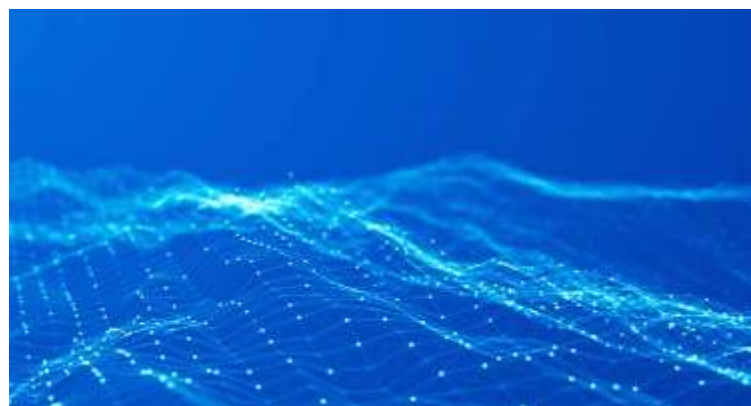
Illustration per https://tinyurl.com/kkfna47m

As we further develop digital navigation solutions, our long-term intention to withdraw from paper chart production remains unchanged and we will continue to withdraw elements of our chart portfolio over the coming period, on a case-by-case basis. However, having listened to the feedback we have received and in light of the consequential impact of the international technical and regulatory steps required to develop digital alternatives, we will be extending the overall timetable for this process. Please be assured that the elements of our paper chart portfolio necessary to support safe navigation for our customers will be maintained throughout this transitional period as we increase our focus on digital navigation products and services.