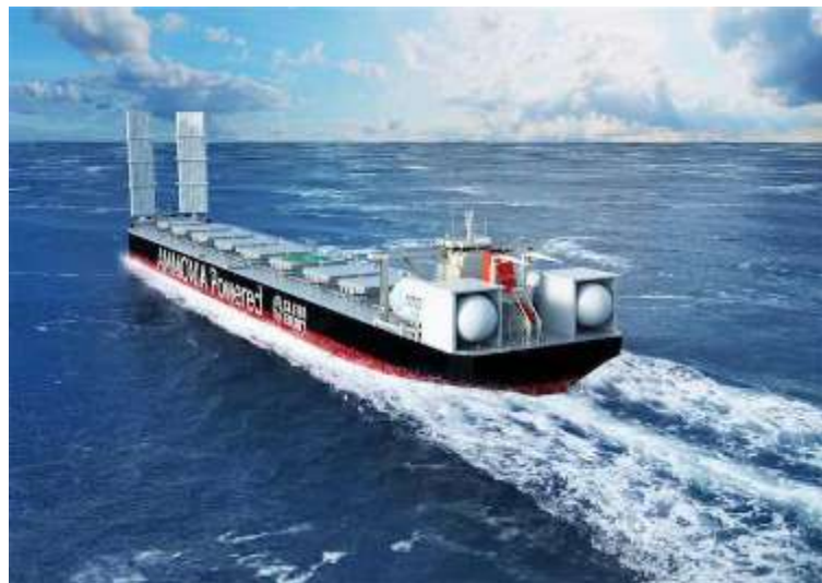
Computer generated image of the 210,000 dt ammonia-fuelled bulk carrier.

It was reported from Tokyo on 27 January that ClassNK had issued an Approval in Principle (AiP) for a large ammonia-fuelled 210,000 dt bulk carrier jointly developed by Mitsui OSK Lines, Ltd (MOL) and Mitsui & Co Ltd.