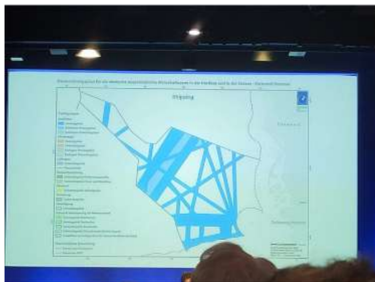
MSP identification of shipping routes in German waters (Kai Trümpler).

Great examples from Anthony Gurnee of Ardmore Shipping Corporation on transitioning to a sustainable and profitable decarbonised shipping future. Average payback on current efficiency investments is about one year – very compelling.