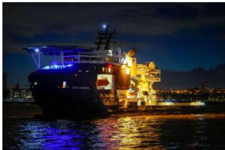
Topaz Tangaroa moored at Cammell Laird's yard, Birkenhead, Merseyside, on 19 January.

In due course it is understood the vessel will be formally handed over to control of the RFA several months ahead of schedule – following an acceleration of the acquisition announced by the UK Defence Secretary in November 2022.