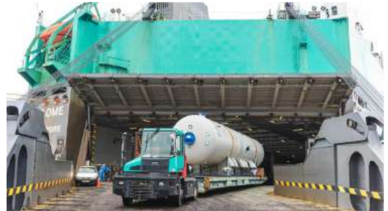
Illustration per https://www.walleniuswilhelmsen.com/

Export of light vehicles from China has boomed over the past couple of years. China has lower production costs than those of western vehicle producers. Solum reflected: 'There is every reason to believe that China will prioritize increasing their export numbers to gain market shares in the growing global electric vehicle market.'