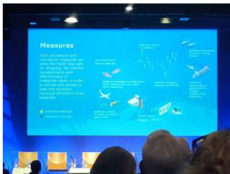
Dutch protection for shipping and offshore developments (Carien Droppers).

A snapshot of some of the interesting topics discussed, particularly in relation to maritime sustainability and offshore wind development appears here.