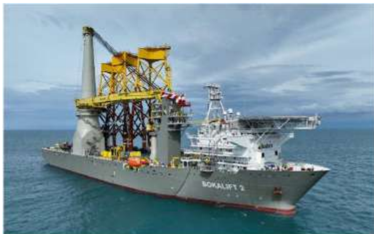
Bokalift 2 of Boskalis a major provider in the dredging, maritime infrastructure and maritime services sectors.

Boskalis is a leading global services provider operating in the dredging, maritime infrastructure and maritime services sectors. The company provides creative and innovative all-round solutions to infrastructural challenges in the maritime, coastal and delta regions of the world. With core activities such as coastal defense, riverbank protection and land reclamation Boskalis is able to provide adaptive and mitigating solutions to combat the effects of climate change, such as extreme weather conditions and rising sea levels, as well as delivering solutions for the increasing need for space in coastal and delta regions across the world.